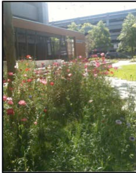
School of Population and Public Health