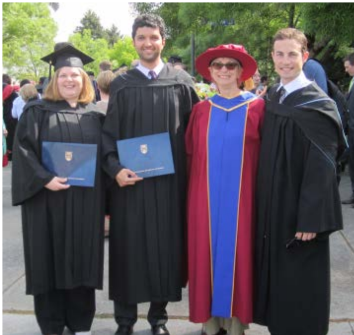
May 2014 graduation

When you meet all the graduation requirements, paperwork is completed so that the following installment of tuition fees does not need to be paid. You will see your account in red in January or May and receive notices from UBC to pay your January tuition – please ignore! As soon as G+PS processes your Program Completion Form, these fees will be reversed by Enrolment Services.