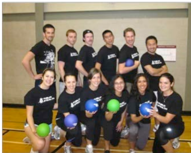
SPPH Public Stealth Dodgeball Team 2011/12

Students in SPPH from all programs participate in various fun activities on and off campus, such as dodgeball, Storm the Wall, longboat racing, and soccer. If you're interested in joining or starting a team, keep an eye out for announcements or come talk to the academic program staff!