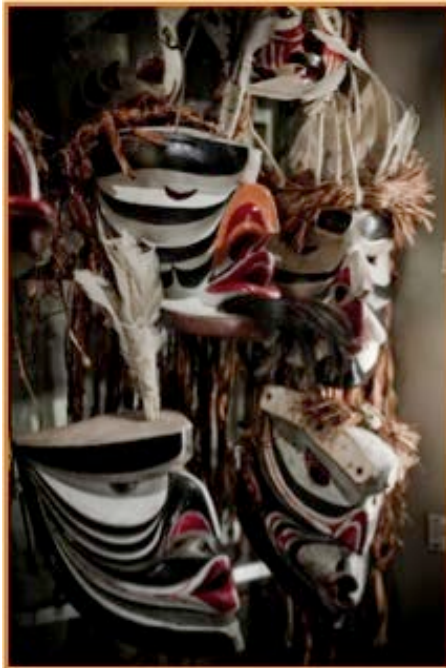
UBC Longhouse art

Aboriginal Students at UBC have access to the First Nations House of Learning , whose mandate is to make the University's vast resources more accessible to Aboriginal Peoples, and to improve the University's ability to meet the needs of First Nations, Métis, and Inuit. The Longhouse is a valuable support network for our Aboriginal students.