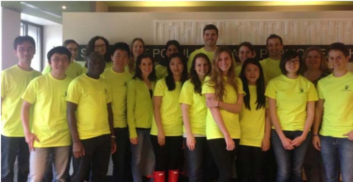
2012/2013 OEH students